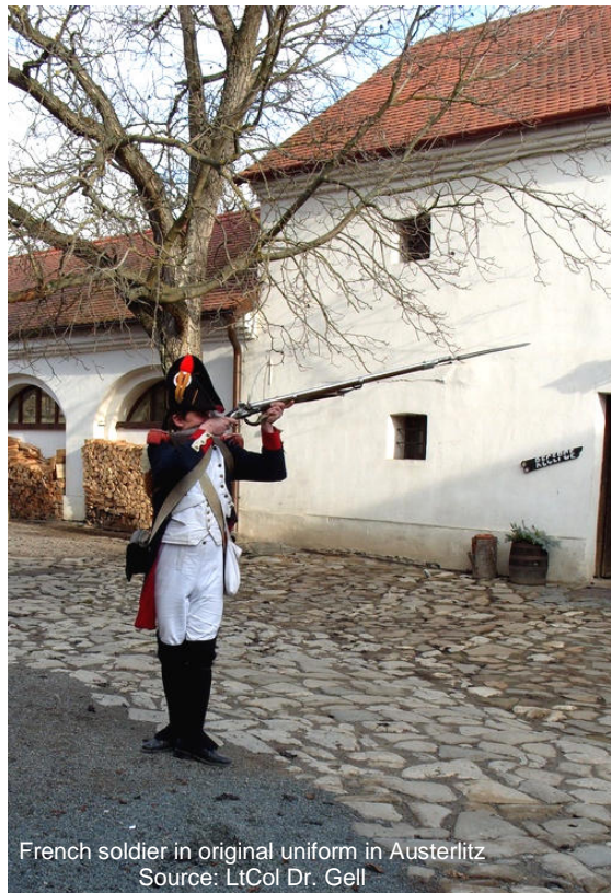
French soldier in original uniform in Austerlitz

Nowadays such meetings which for sure will enhance the interoperability become more and more important. European Union Member States should profit on each level by each other. In recent times, not only because of the establishment of "European Union Battle Groups", there is a need and room for improvement of harmonizing military training regarding military leaders.